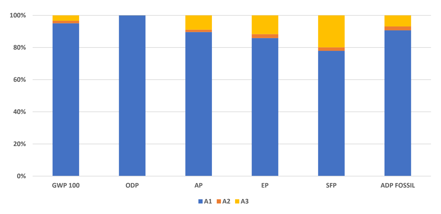
Figure 3: Relative contributions by module, IPCC AR5 + TRACI 2.1 impact categories

To facilitate a more detailed understanding of the contributions from different mill and fabrication processes, an analysis is included in this section which details the contribution from Modules A1, A2, and A3. The results in Figure 3 are shown below for steel joists and joist girders to facilitate a better understanding of which categories contribute most to which impacts.